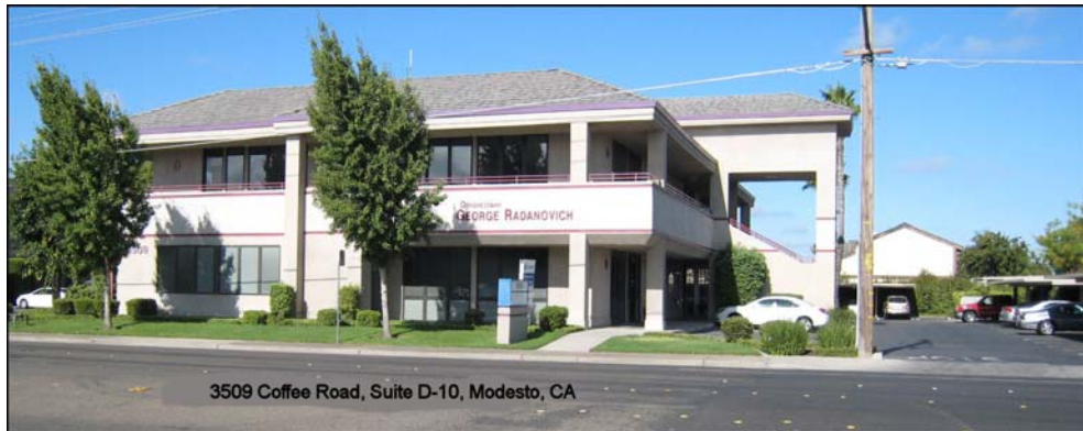
3509 Coffee Road, Suite D-10, Modesto, CA