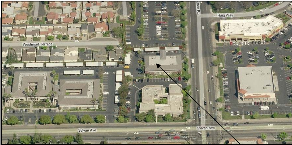
3509 Coffee Road, Suite D-12, Modesto, CA Stone Office Park