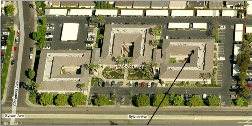
1101 Sylvan Ave., Suite C-205, Modesto, CA Sylvan Office Park