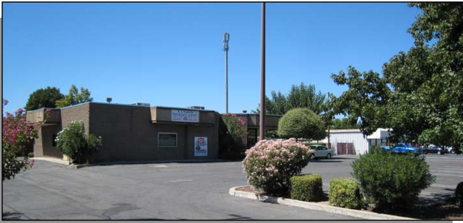
1021 Oakdale Road, Modesto, CA